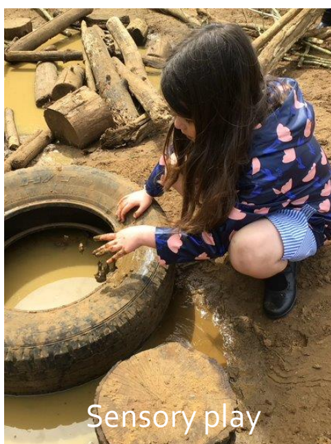
Safe risk taking